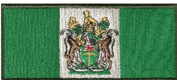
Rhodesian Flag: Sew On measures 120mm x 58mm