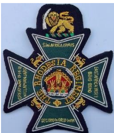
Rhodesia Regiment high quality bullion wire: For blazer