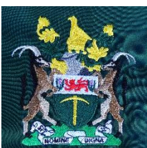
Coat of Arms: For Blazer