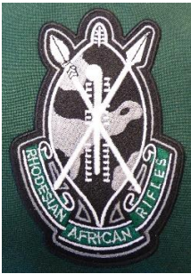
Rhodesian African Rifles: For Blazer