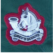
Grey's Scouts: For Blazer