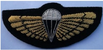
Copy of Rhodesian SAS No 1 dress wings in bullion wire: measure 75mm x 35mm