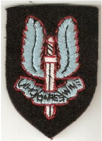
SAS: For cap and as a sew on for berets. This is a copy of the original SAS beret badge