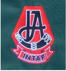
Intaf: For Blazer