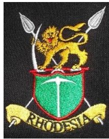
Rhodesian Army: For cap, sew on badge with green or black backing and on shirts