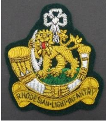
RLI high quality bullion wire: For blazer