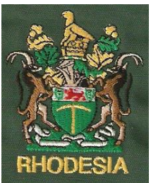
Coat of Arms: For cap and beanie, as a sew on and for shirts