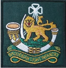
RLI: For cap, sew on badge and on shirts