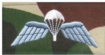
Copy Rhodesian Para Wings: On green or camo backing