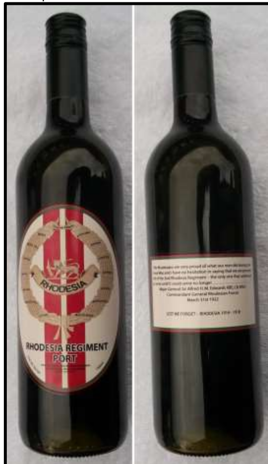
Front and back labels.

Price NZ$40 per bottle + P&P – we will ship world wide