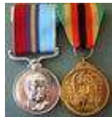
Medals & Ribbons – an extensive range available.