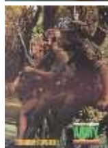
Posters & Maps – high quality reproductions.