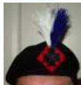
Berets & Badges – most Rhodesian units available.