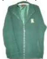
Clothing - shirts, jackets, caps, beanies, aprons, and regimental ties.

thecqstore@rhodesianservices.org Please note that we can only process credit cards via PayPal. We do not accept postal orders or Western Union transfers. Rest assured, if you want to make a purchase we will make a plan to enable you to pay!